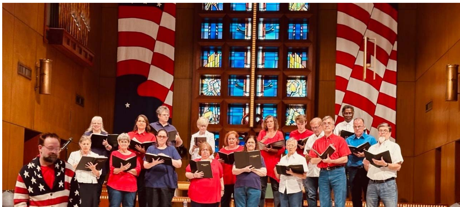
July 4th Concert 2023—Trinity-Downtown